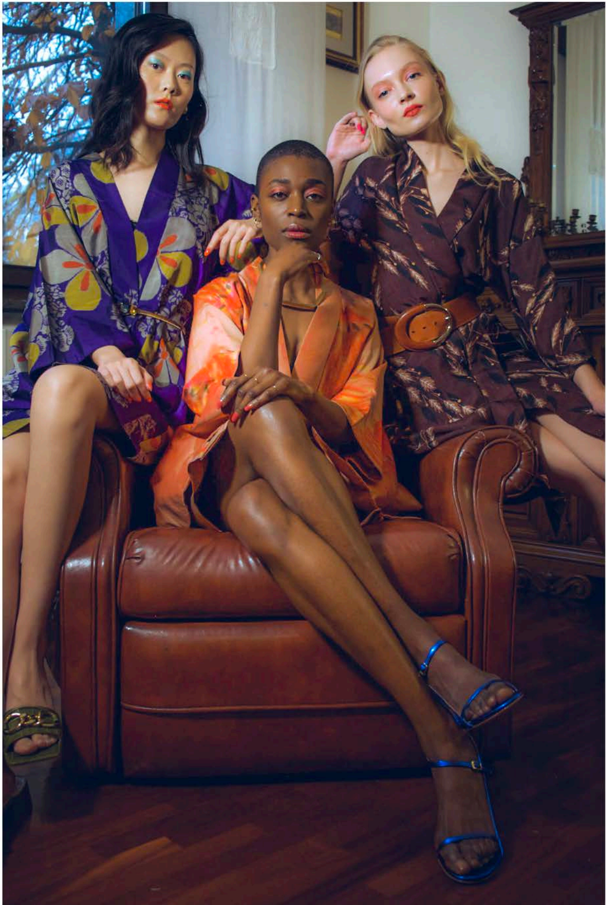
Kimonos HAORI HARMAT , Scarpe FABIO RUSCONI