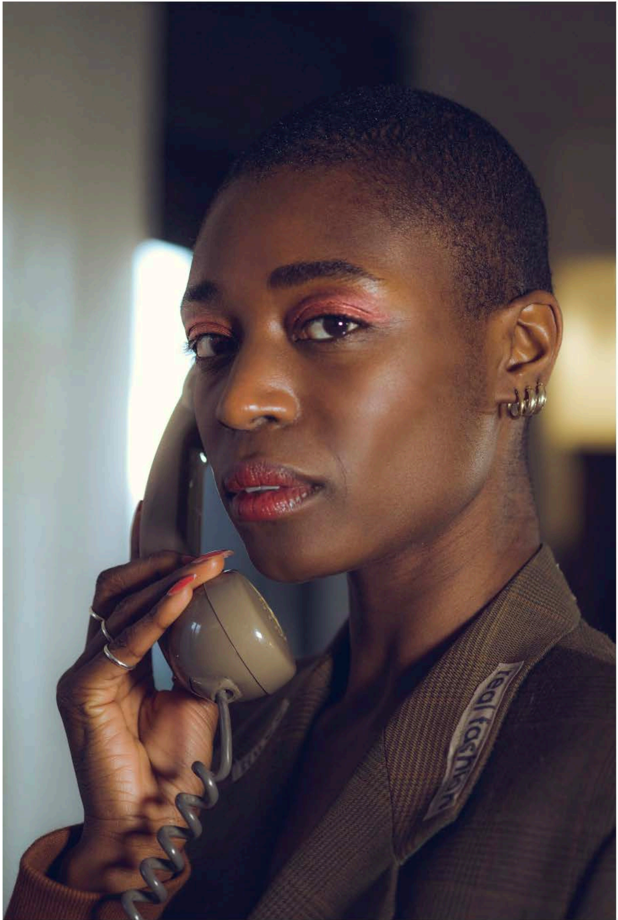
Anelli e orecchini MODEL'S OWN , Giacca LOLALOVE