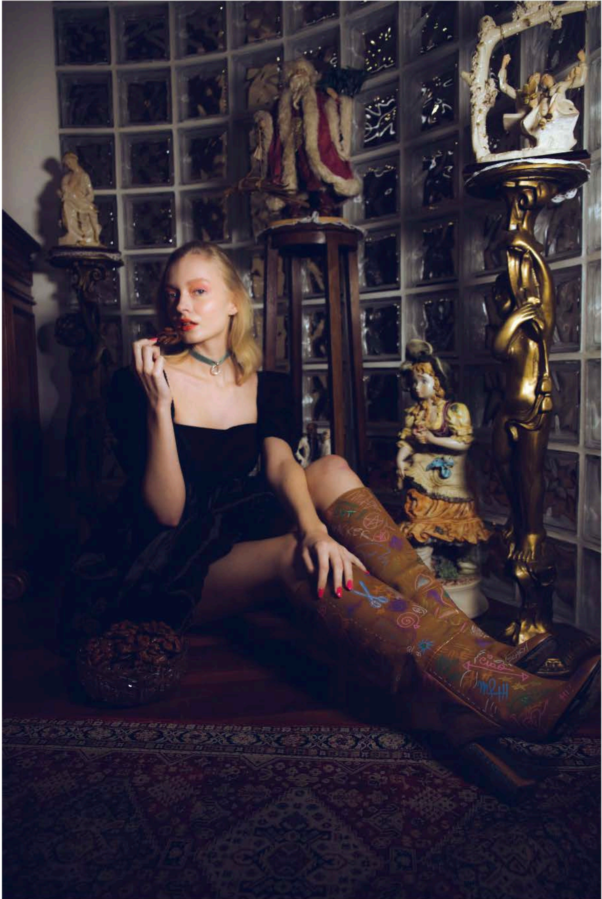
Abito TPN , Scarpe SIMON CRACKER , Chocker ABSIDEM