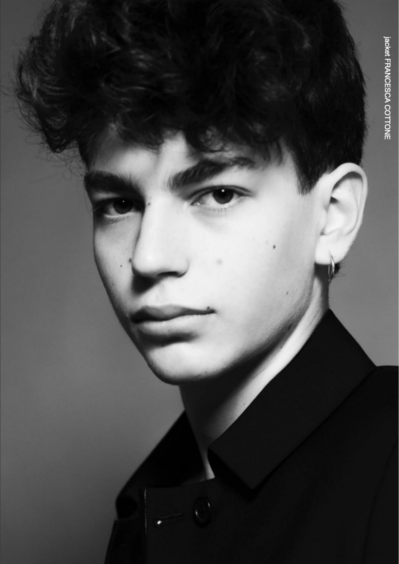
Jacket: FRANCESCA COTTONE