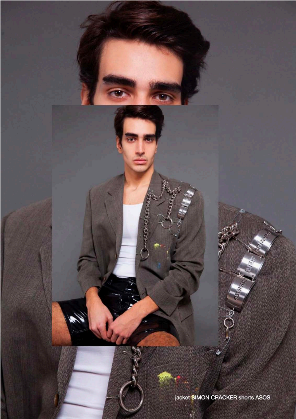
jacket SIMON CRACKER shorts ASOS