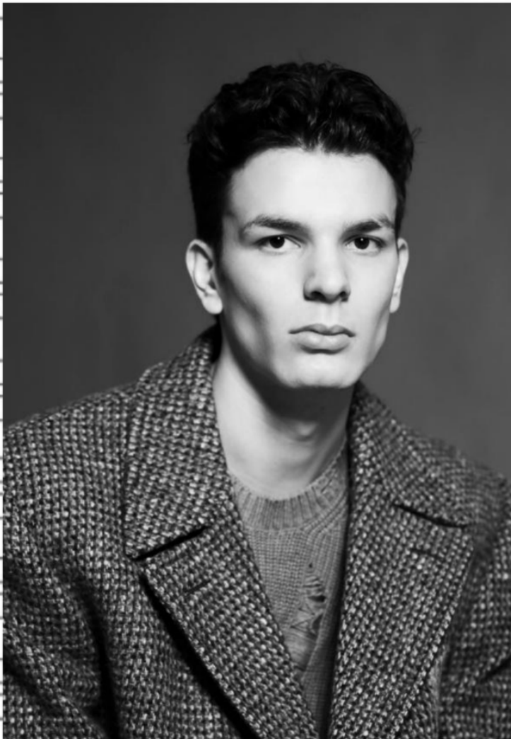
coat SIMON CRACKER pullover ASOS