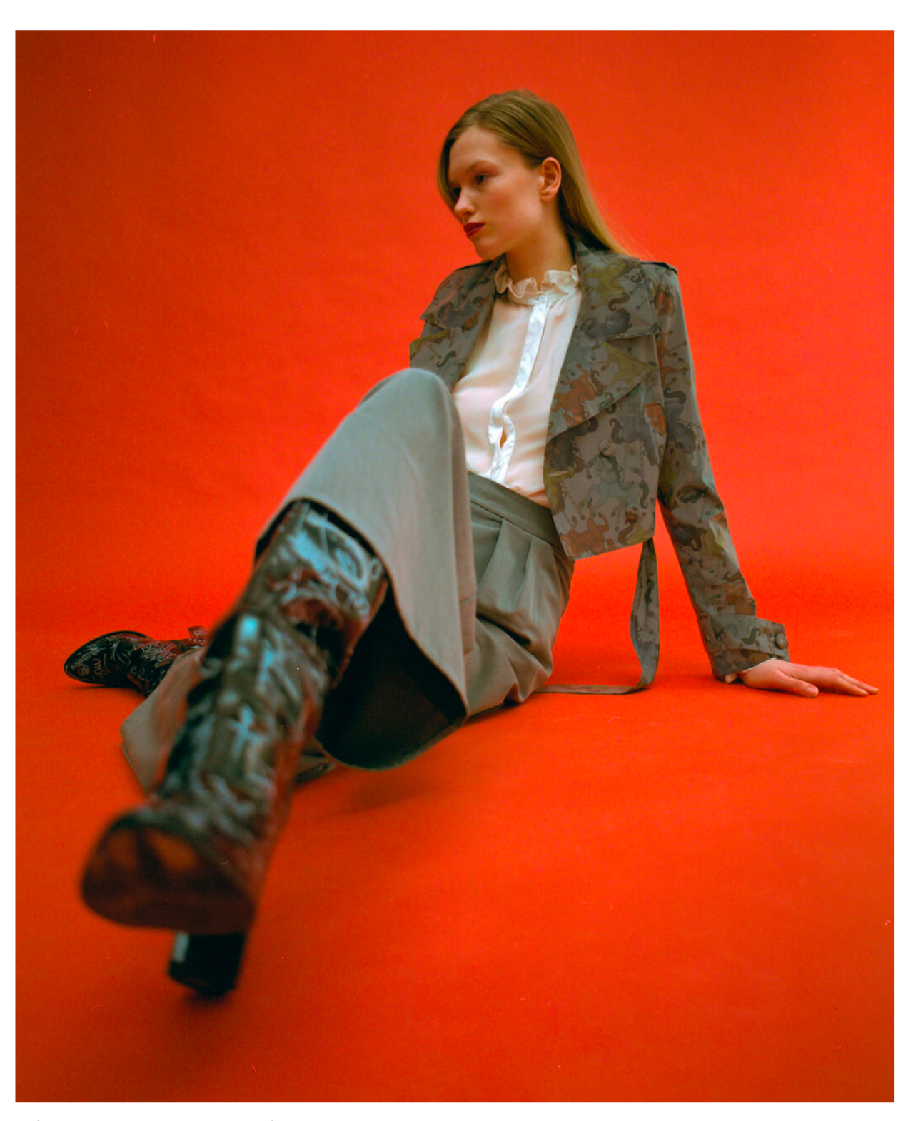
Jacket BARTOLOTTA & MARTORANA Shirt FABIANA FERRI Pants FLAVIA MARDI Shoes SIMON CRACKER