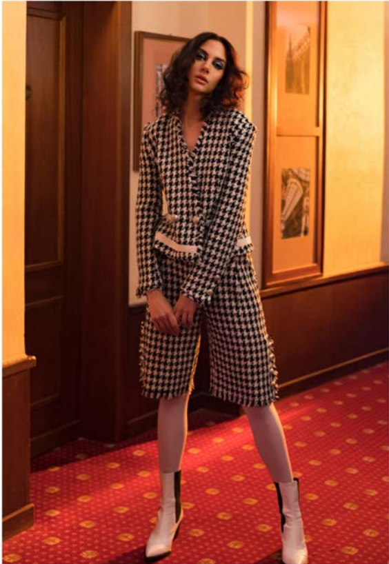
HAUTE PUNCH MAGAZINE