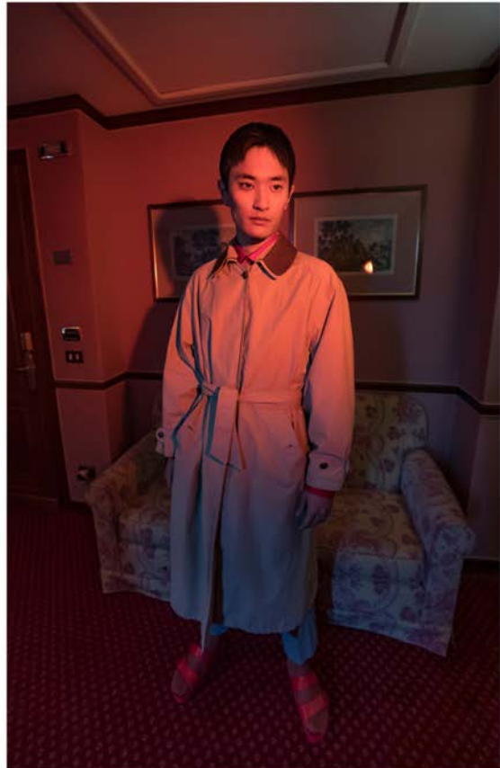
HAUTE PUNCH MAGAZINE