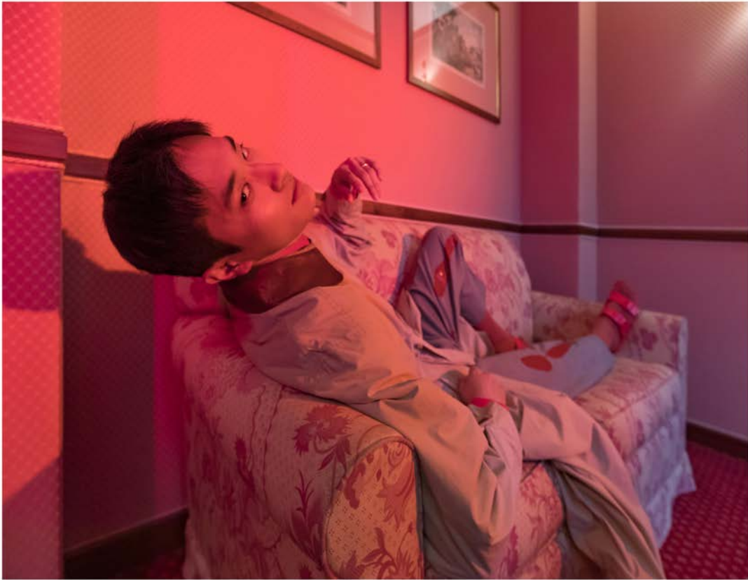
HAUTE PUNCH MAGAZINE